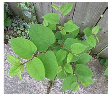
Japanese knotweed

Cutting a way through the undergrowth is the main problem. The strongest clumps are usually well out of reach. Once there a quick cut with the loppers and a syringe full of diluted glyphosate weedkiller