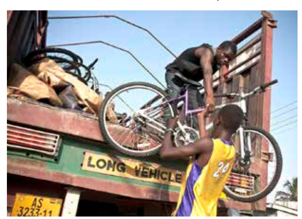
Avenues bikes on their way to villages in Ghana

As you read this, the first batch of nearly 300 donated bikes from Hull should be making their way to northern Ghana to help children attend school and adults provide education and health care.